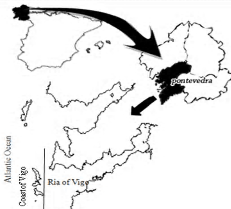
Fig. 1. Map showing the coastal area of Vigo and Ría de Vigo (Miño river estuary) with the selected sampling stations

Muscle contained from 0.14 to 0.69 mg of Hg/Kg d.w., while values in the liver and kidney were in the range of 0.2- 0.77 and 0.015- 0.58 mg/Kg d.w. respectively (tab. 2). Hg content in muscle and liver of this species is higher than most values reported for the Mediterranean (Usero et al. , 2003). The EC Regulation (EC, 2006) has established a regulatory limit for muscle fish consumption. Sole has not exceeded this limit indicating a steady condition and good quality of the edible parts regarding this metal. Cd values were higher in liver than in the kidney and muscle (tab. 2, Fig. 2).